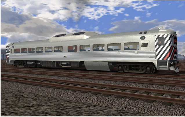
Budd RDC-1 PC-1