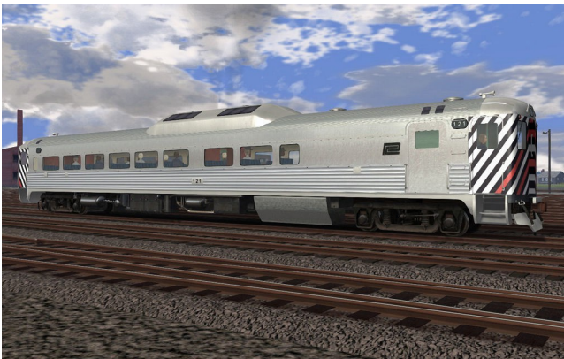
Budd RDC-2 PC-1