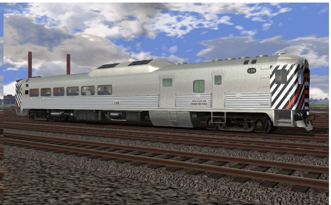
Budd RDC-3 PC-1