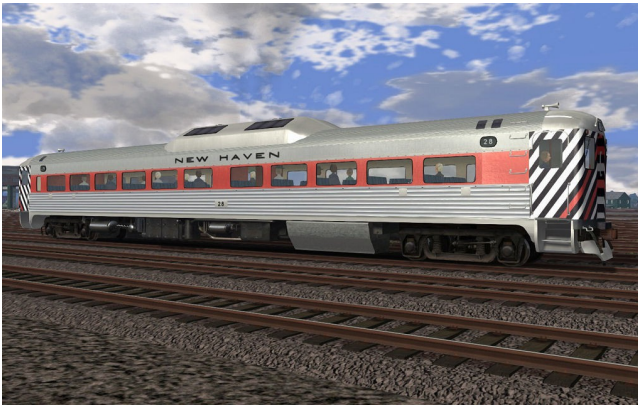
Budd RDC-1 PC-3