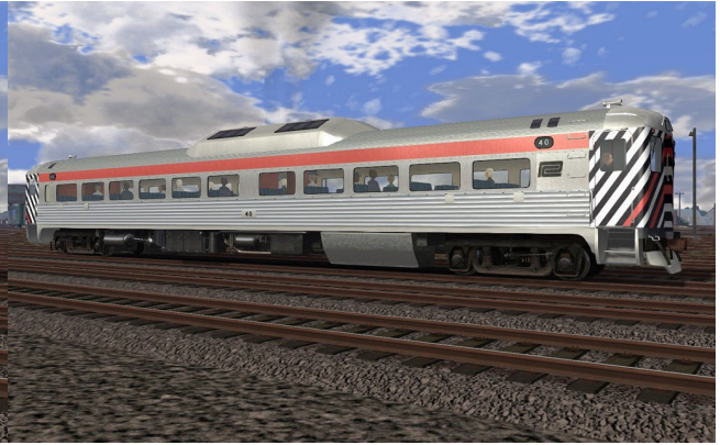
Budd RDC-1 PC-2